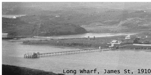
Long wharf, James St, 1910