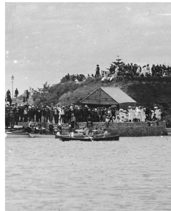
Finish of rowing race at the Raglan jetty in January 1911