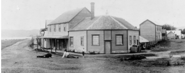
General store, corner of Cliff and Wallis Sts, 1897